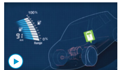
Battery Electric Vehicles A film by NaturalResourcesCa